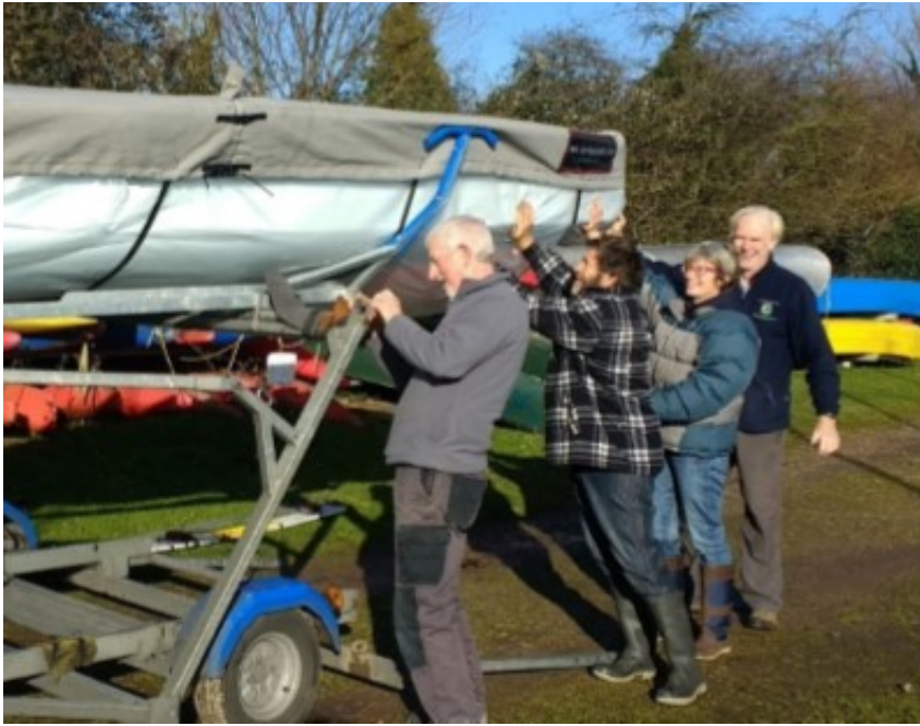
The new Hartley 15s arriving at the club

Another important date in May is the 20 th when we will be running the first of our annual Open Days to offer 'come and try it' sessions to members of our community. Please note the date – we'll need lots of help to make the weekend a success and of course I hope that you will also be able to help promote the event.