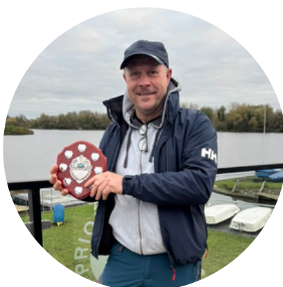
KEVIN GUARD LASER SHIELD