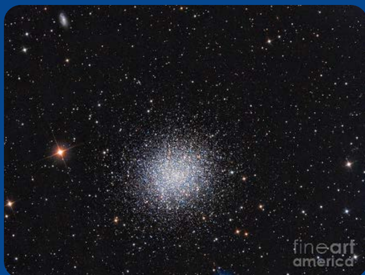
An image of M13

This was a fantastic evening(s). Thanks to the Bedford Astronomical Society and the PSC committee for organising the visit.