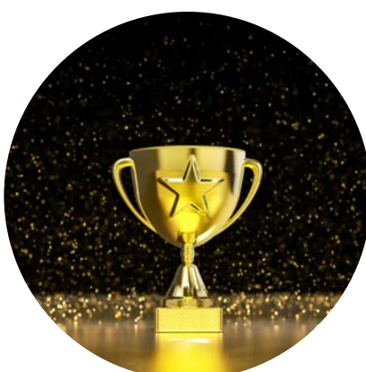
JIMMY FIRST NOVICE WINTER WARMER