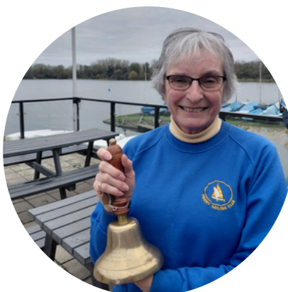
THE CLEANING TEAM OFF THE WATER CONTRIBUTION