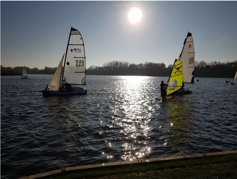
Charity Cup Race 2018 held before the AGM